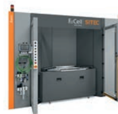
FlexCell basic 批量生产 Series production