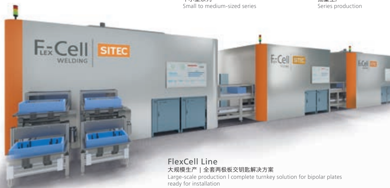
FlexCell Line 大规模生产 | 全套两极板交钥匙解决方案 Large-scale production | complete turnkey solution for bipolar plates ready for installation