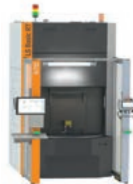
LS basic 中小型系列 Small to medium-sized series

Demand-optimized we plan and supply scalable production systems worldwide, ranging from manual, semi-automated to fully automated.